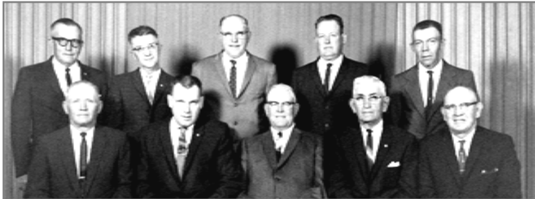
October 13, 1964