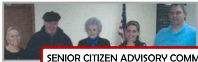
SENIOR CITIZEN ADVISORY COMMITTEE