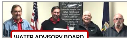
WATER ADVISORY BOARD